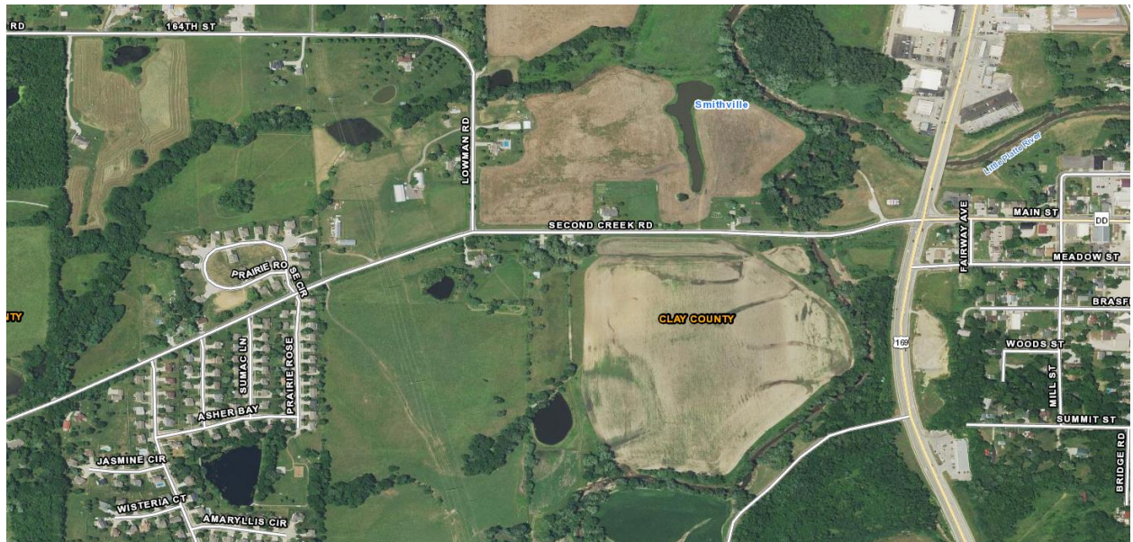
Exhibit A - Location of Project